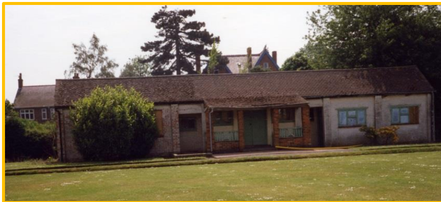
Forest Road, Bowls Pavilion and Green. Photo Taken 1993 just before it got demolished for building of flats. Now Kingfisher Court.