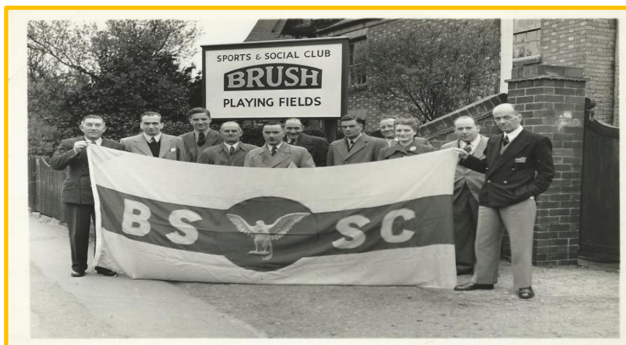
Brush Sports and Social Club Playing Field, Forest Road, Loughborough.